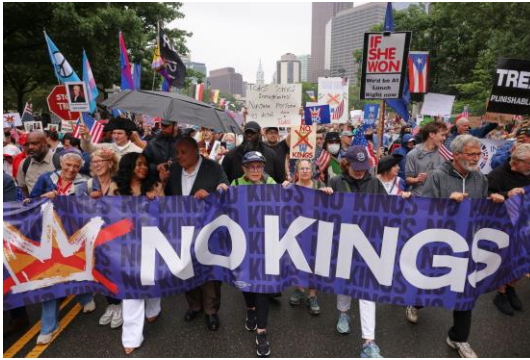
Crowds supporting "Presbyterianism"

Number crunchers tell us the Presbyterian Church (USA) is shrinking faster than any other mainline Protestant denomination. So, it was rather gratifying recently to see literally millions of people throughout our land taking to the streets to promote an idea that has its roots in Presbyterianism!