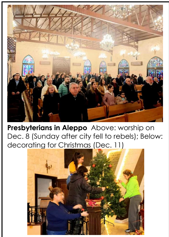
Presbyterians in Aleppo Above: worship on Dec. 8 (Sunday after city fell to rebels); Below: decorating for Christmas (Dec. 11)

This past weekend, Aleppo, Syria's second-largest city, was seized in a lightning offensive by Hayat Tahrir al-Sham (HTS), a rebel force formerly linked to Al Qaeda. In less than 48 hours, the city fell almost without resistance from the Syrian army and its allies. On Friday, Aleppo's residents slept under the government's sovereignty. By Saturday, they awoke to a city under new rule.