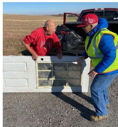
Here's the Murray Presbyterian crew that did litter clean-up along the 2.5 mile stretch of Hwy 1 our congregation has adopted. They even hauled away an old door! Thank you to everyone helping to preserve the beauty of God's creation!