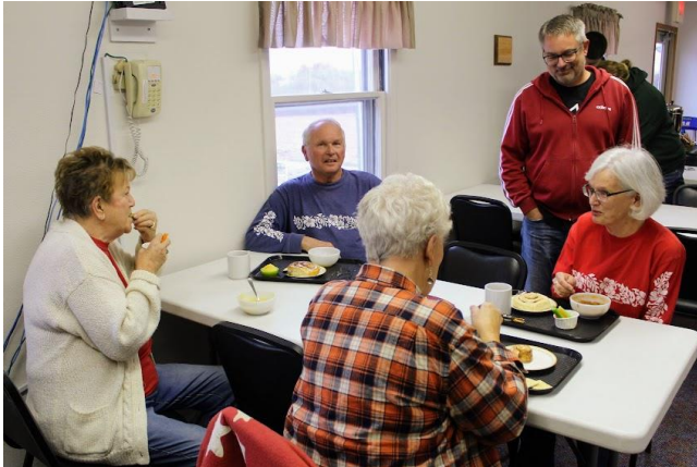
Our last free community event of the year was a Fall festival, featuring soup and chili, pumpkin decorating, guessing jars, and a fire pit. We have made lots of new friends from our area!