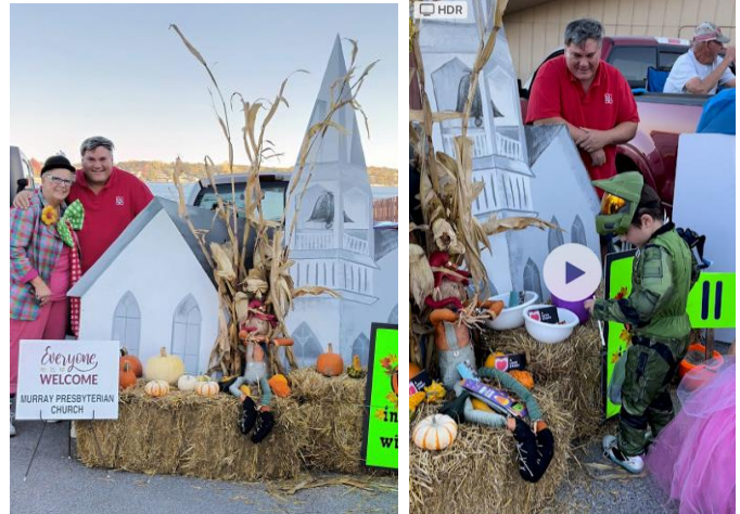
Trick or treaters stop at Murray Presbyterian's station, where they received treats, an encouragement to "Fall in Love with Jesus," and a reminder that "Everyone is welcome at Murray Presbyterian Church."